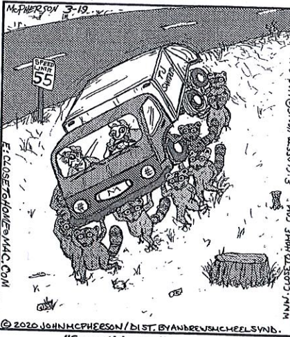
"Something tells me our 'Sanitation Crew of the Year' award just went out the window!"