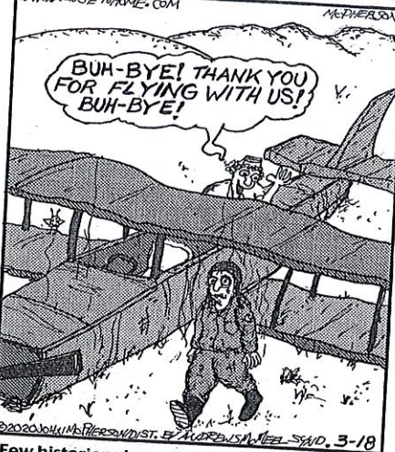
Few historians know that the Wright Brothers had a flight attendant aboard their first flights.